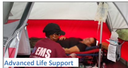
Advanced Life Support