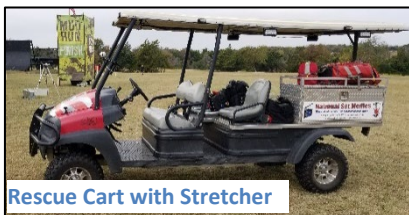
Rescue Cart with Stretcher