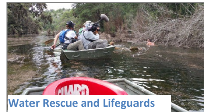
Water Rescue and Lifeguards